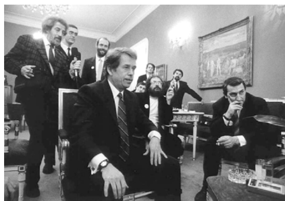
One of the many leading figures of Czech political, economical and cultural life who taught at the Faculty was Václav Havel , the first post-communist president of Czechoslovakia and the first president of the Czech Republic.

Currently, the Faculty of Social Sciences has more than 3,000 full-time students. Around 300 foreign students spend part of their studies here. It is fair to say we have students from literally all over the world.