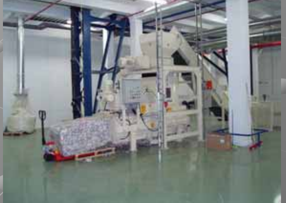
4 pcs on one place for automatic sorting, pressing inside plastic