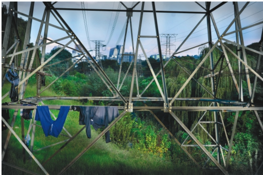
Tanisha Bhana: LINES OF POWER, Archival Pigment Print, 2014