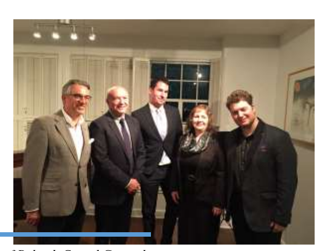
Visegrad Group with artits (from left): Consul General of Poland, Consul General of the Czech Republic, Deputy Consul General of Hungary