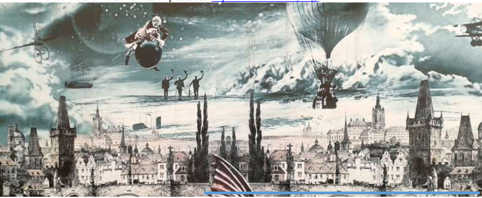
Karel Zeman was a world pioneer of the animated fantasy world.