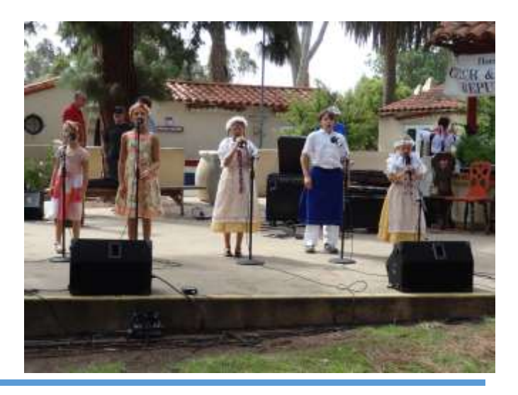
Sokol San Francisco children performing at San Diego Lawn Program

In October, a group of seventeen Sokol members traveled to San Diego to meet with the Czech and Slovak community and to enjoy a full weekend of the Czech and Slovak Lawn Program. We were very pleased that Sokol children from the Czech School also contributed to the program. The unique International Village in Balboa Park and the well prepared program were wonderful and we made personal contacts with the large San Diego Czech and Slovak family.