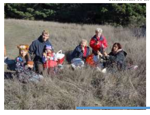
Picnic after a mushroom hunting