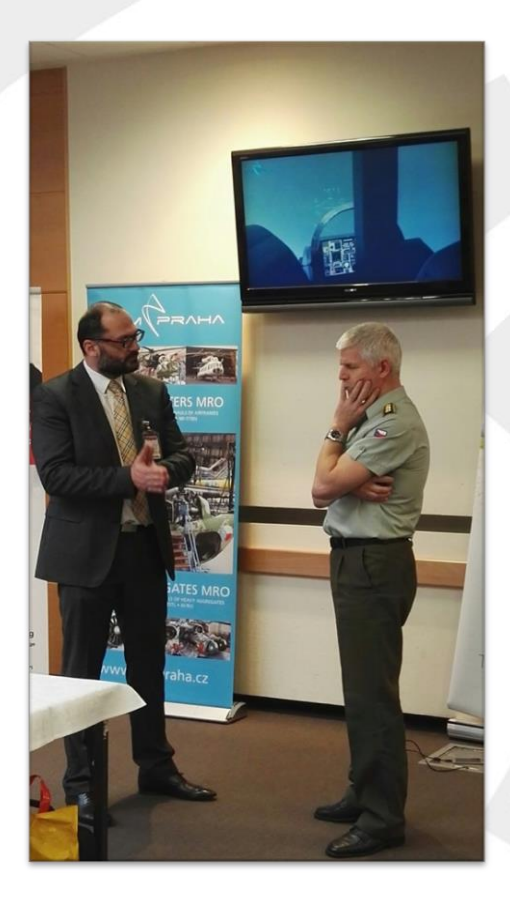
Together with Chairman of the NATO Military Committee