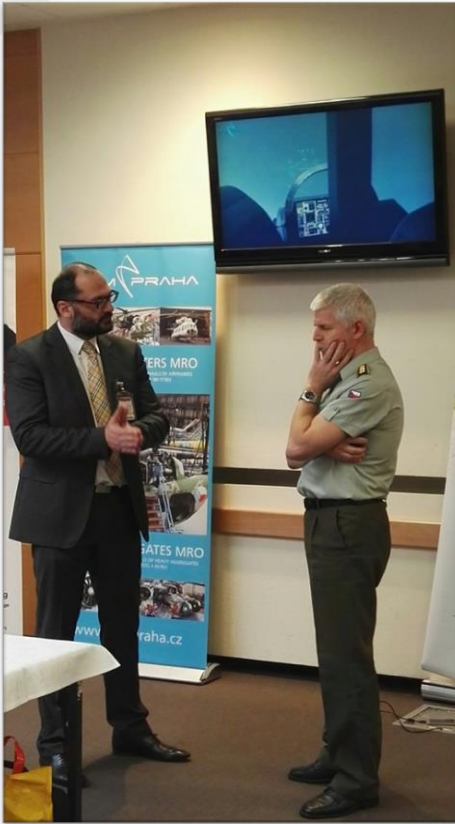
Together with Chairman of the NATO Military Committee