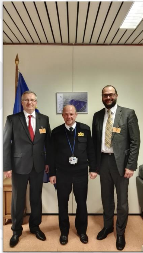
Together with Deputy Director General EUMS