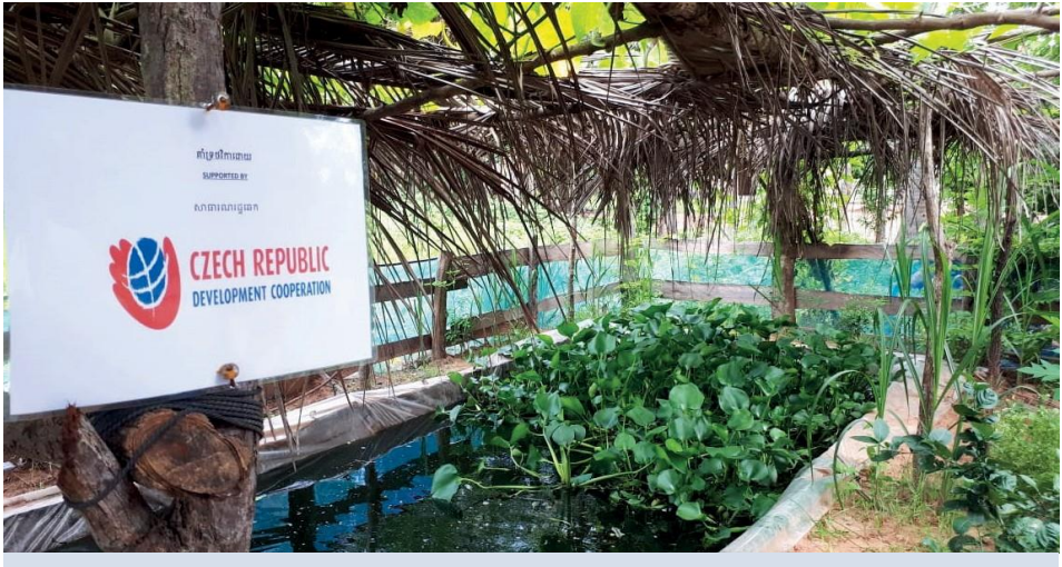
The project supported families in need of livelihoods, e.g. by breeding fish in small water reservoir.

Small scale projects are financed by the Ministry of Foreign Affairs of the Czech Republic and coordinated directly by the Embassy in Phnom Penh. These are one-year projects with a smaller financial scope (up to a maximum of 500 000 CZK/23 000 USD), which may suitably complement other projects financed by the Czech Development Agency and contribute to fulfilling the set priorities. Small projects have been an integral part of development cooperation since 2006 and, through direct on-site funding, contribute to supporting civil society and nongovernmental organizations at local level. The projects are one-year projects and their implementation lasts for a maximum of 8 months (March – October).