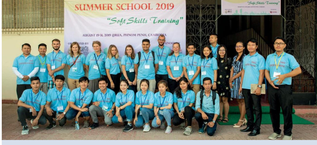
Students\ of\ the\ summer\ school\ organized\ in\ cooperation\ with\ the\ Royal\ University\ of\ Agriculture

Various projects implemented so far by the Czech University of Life Sciences in Prague and Mendel University in Brno have helped to build expertise in agricultural and forestry through specialized seminars for teachers and students, practical fieldwork, field data collection and analysis as a part of academic research and other activities supporting development of research capacities of Cambodian experts.