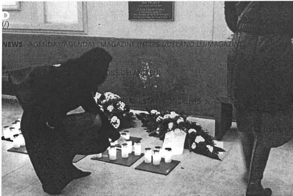
Attendees at the commemoration ceremony were invited to place a candle in remembrance of Palach