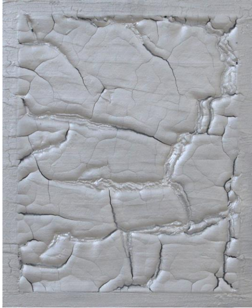
3. Barbora Kysilková (*1983) MODEST DECADENCE, 2012 oil on marble slab 40 x 30 cm