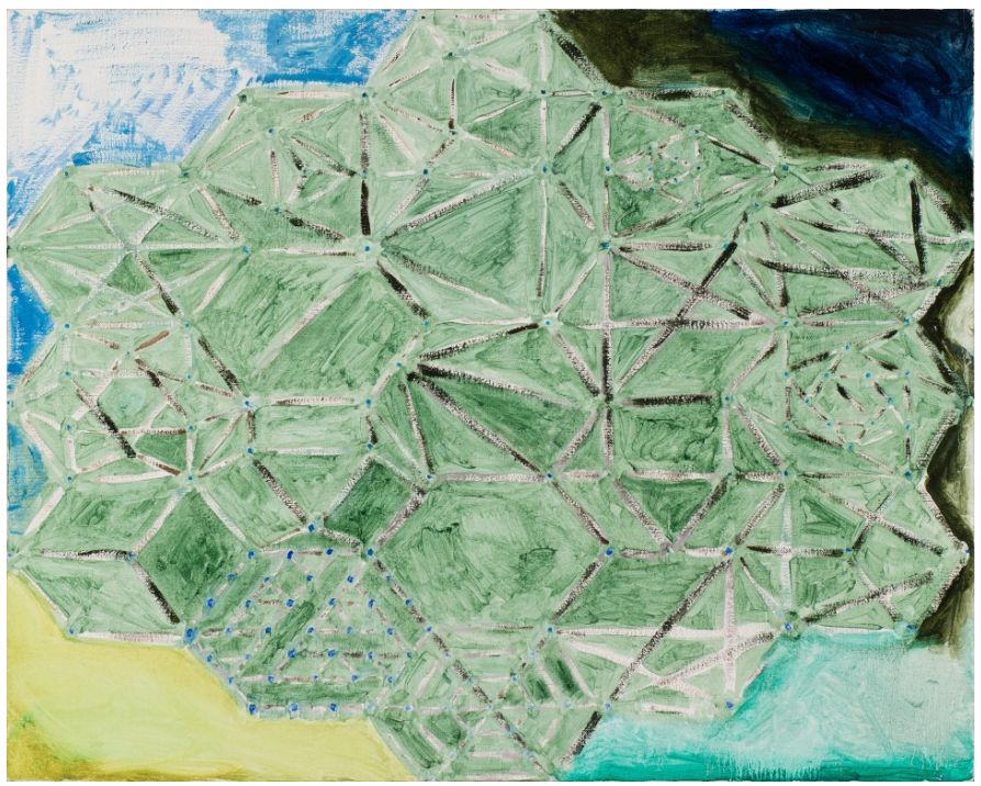
Vladimír Kokolia, Crown (2014). Oil on canvas.