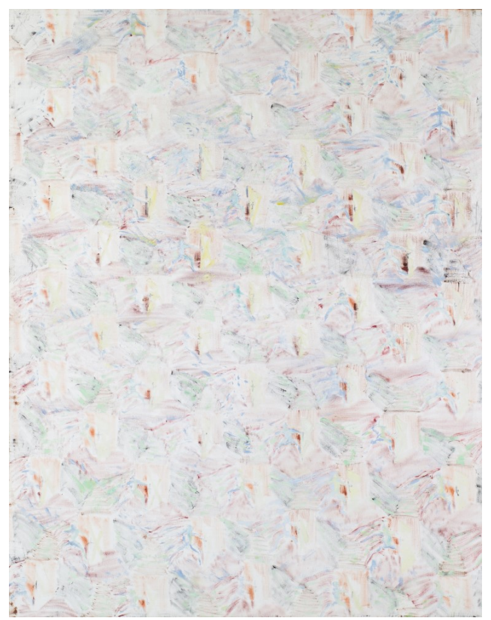
Vladimír Kokolia, Roads and Doors (1986). Oil on canvas.

Ikon Gallery 1 Oozells Square, Brindleyplace, Birmingham B1 2HS 0121 248 0708 / www.ikon-gallery.org Open Tuesday-Sunday & Bank Holiday Mondays, 11am-5pm / free entry Registered charity no. 528892