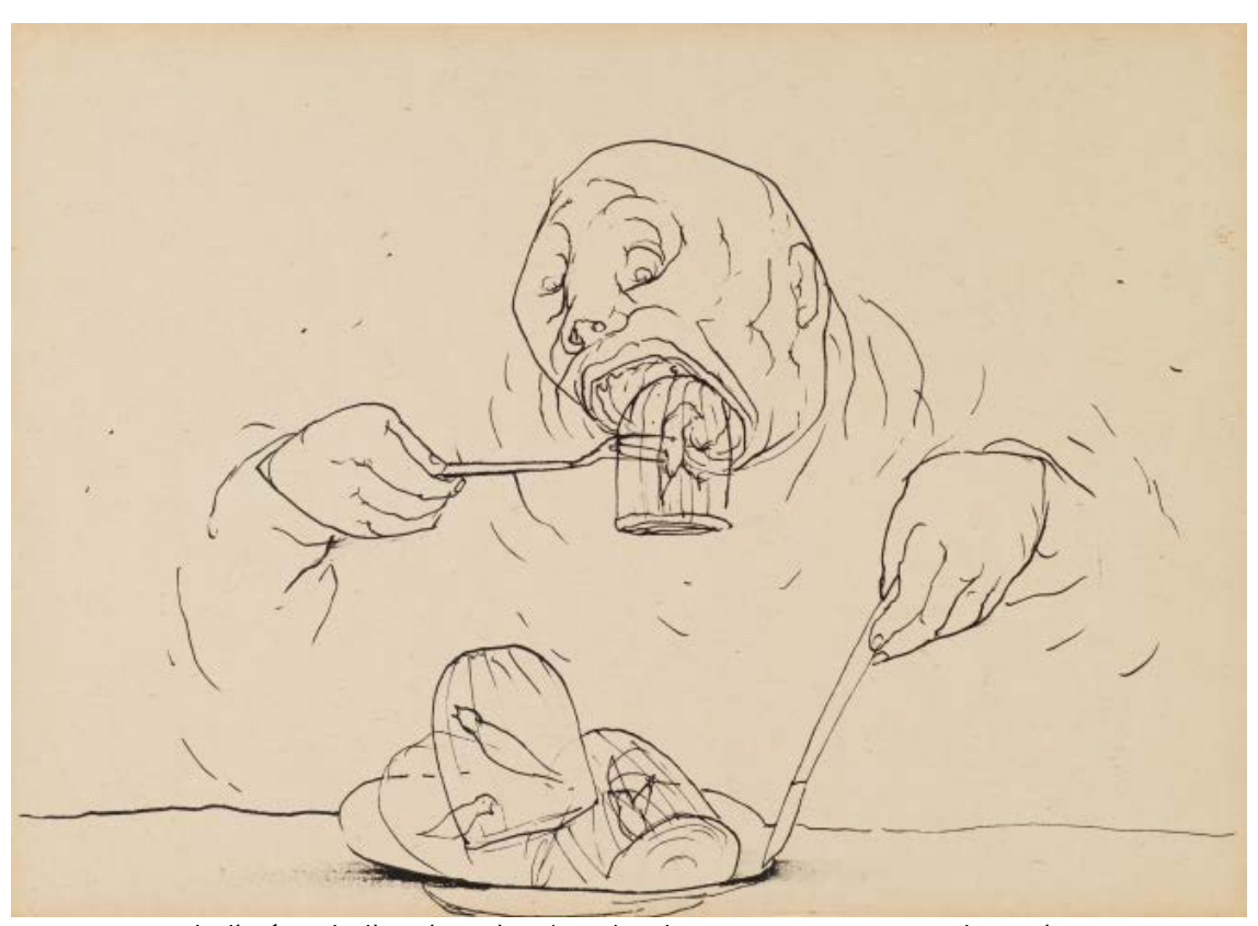
Vladimír Kokolia, Big Series (1983). Ink on paper.