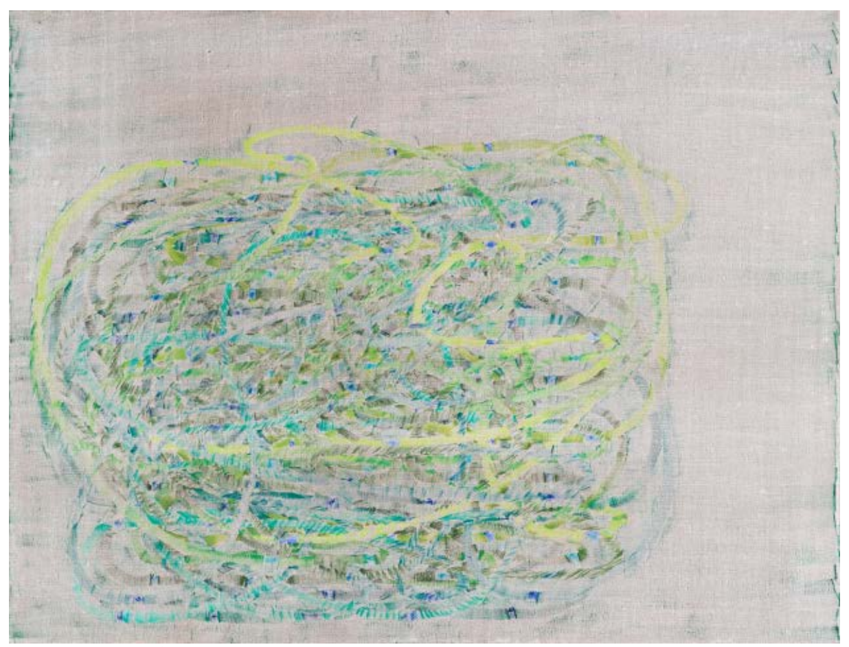
Vladimír Kokolia, Looking at Ash Tree (2016). Oil on canvas.

Ikon presents the first UK exhibition of work by Vladimír Kokolia, the renowned Czech artist who established himself on the international circuit at Documenta 9, 1992. A combination of new and recent paintings, plus drawings and installations, the show exemplifies an intensely experimental attitude that distils abstraction from everyday experience.