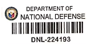
DELFIN N. LORENZANA Secretary, Department of National Defense IATF Co-Chairperson NTF Chairperson

APPROVED during the 168th Inter-Agency Task Force Meeting, as reflected in the minutes of the meeting, held this May 26, 2022, via video conference.